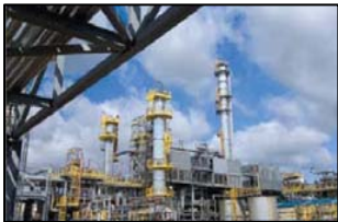
Various Onshore Assets