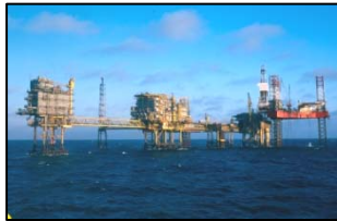
Gorm A & E