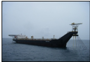
Rang Dong I FPSO