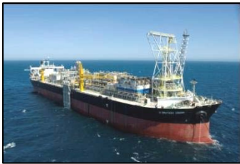
Modec Venture 11 FPSO