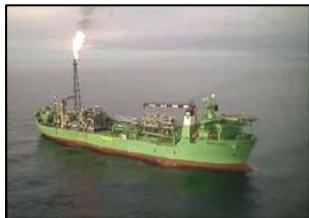
Uisge Gorm FPSO