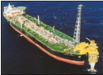
Cossack Pioneer FPSO