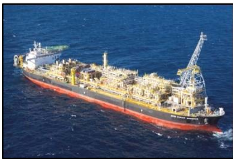
Stybarrow Venture MV 16 FPSO