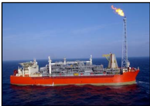
Sea Rose FPSO