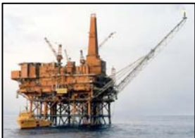
Ming Zhu FPSO