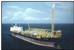
Tantawan Explorer FPSO