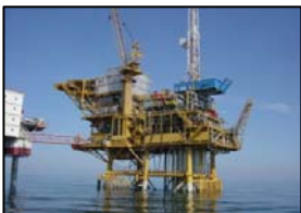
WHPs A, B, C & D