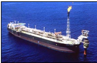
Griffin Venture FPSO