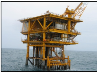
Su Tu Den WHP A