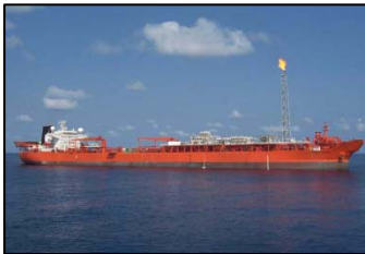
Front Puffin FPSO