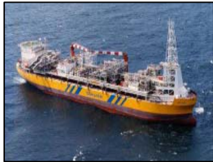
Bleo Holm FPSO