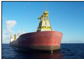
Chevron Alba FSU