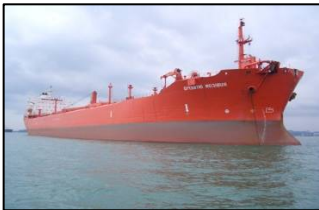
Rubicon Intrepid FPSO