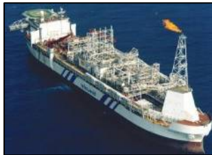
Glas Dowl FPSO