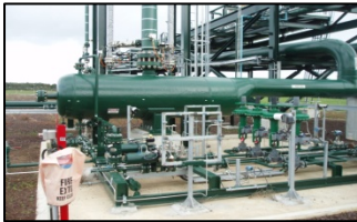
Tubridgi Gas Plant