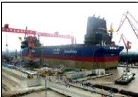
Peng Bo FPSO