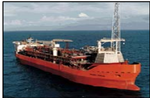
Maersk Curlew FPSO