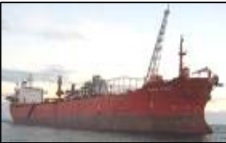
Rubicon Vantage FPSO