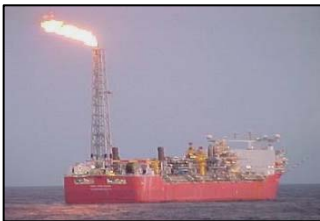
Terra Nova FPSO