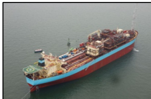
Various Trading Ships