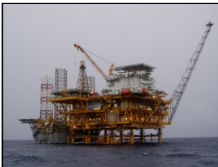
Thai Binh FPSO