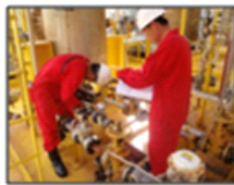
Pressure System IRM