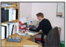
Integrity / Compliance System