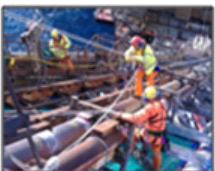
Piping / Vessel R&M