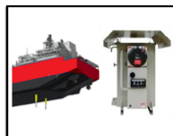
In-Water Corrosion Protection