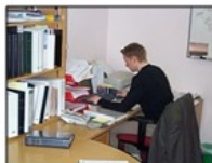
Integrity / Compliance System