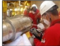
Pressure System IRM