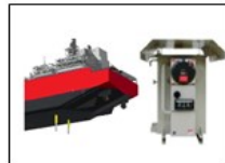
In-Water Corrosion Protection