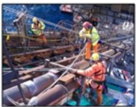
Piping / Vessel R&M