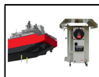
In-Water Corrosion Protection