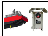
In-Water Corrosion Protection