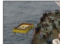
In-Water Structural R&M