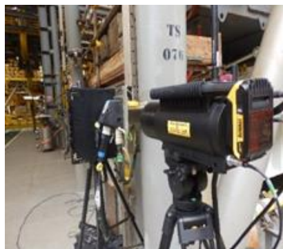
ExPert X-ray set-up