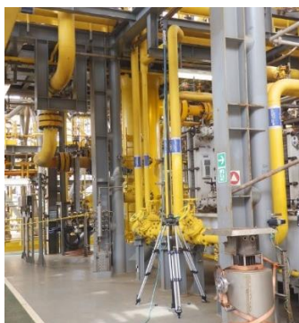
ExPert Telescopic Inspection set-up