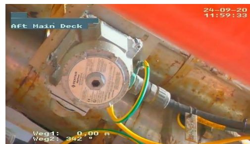
ExPert remote visual inspection

EM&I are now in discussions with a major owner and operator of petrochemical installations to provide their ExPert services under a Joint Venture and to supplement the new methods with refined RBA HAEE techniques to significantly lower the quantity of Ex inspections according to thousands of actual inspection findings with associated analysis that has been gathered over many years of operations and is already accepted by regulatory bodies globally.